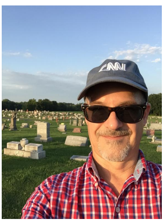
The author at Oak Hill Cemetery, Riley, Indiana.

The bottom line is that online searches can only take you so far. At some point you need to put your feet on the ground and actively seek out information. More than that, a genealogy can't be built on someone else's assumption...each connection in the tree must be mortared in place with supporting documentation. The clues are there, we simply need to go in the direction that they point.