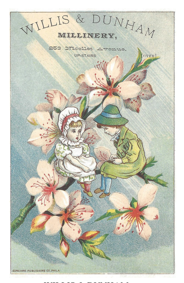
WILLIS & DUNHAM MILLINERY 253 Nicollet Avenue

As a professional genealogist compiling a history of all the Dunhams in America, I have researched this family for many years. However, there were still some Dunhams whose ancestry I had not been able to trace back. Recently a friend pointed me to the JustaJoy web site and said that there were some items containing the Dunham surname for sale on that site. I went to the site and found an interesting looking trade card advertising the Willis and Dunham Millinery shop in Minneapolis, MN. I purchased the card from the vendor and when it arrived I found it to be in excellent condition just as the description on the JustaJoy web site had stated.